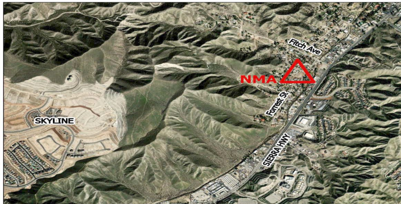
NEW MINT ASSOCIATION VICINITY MAP